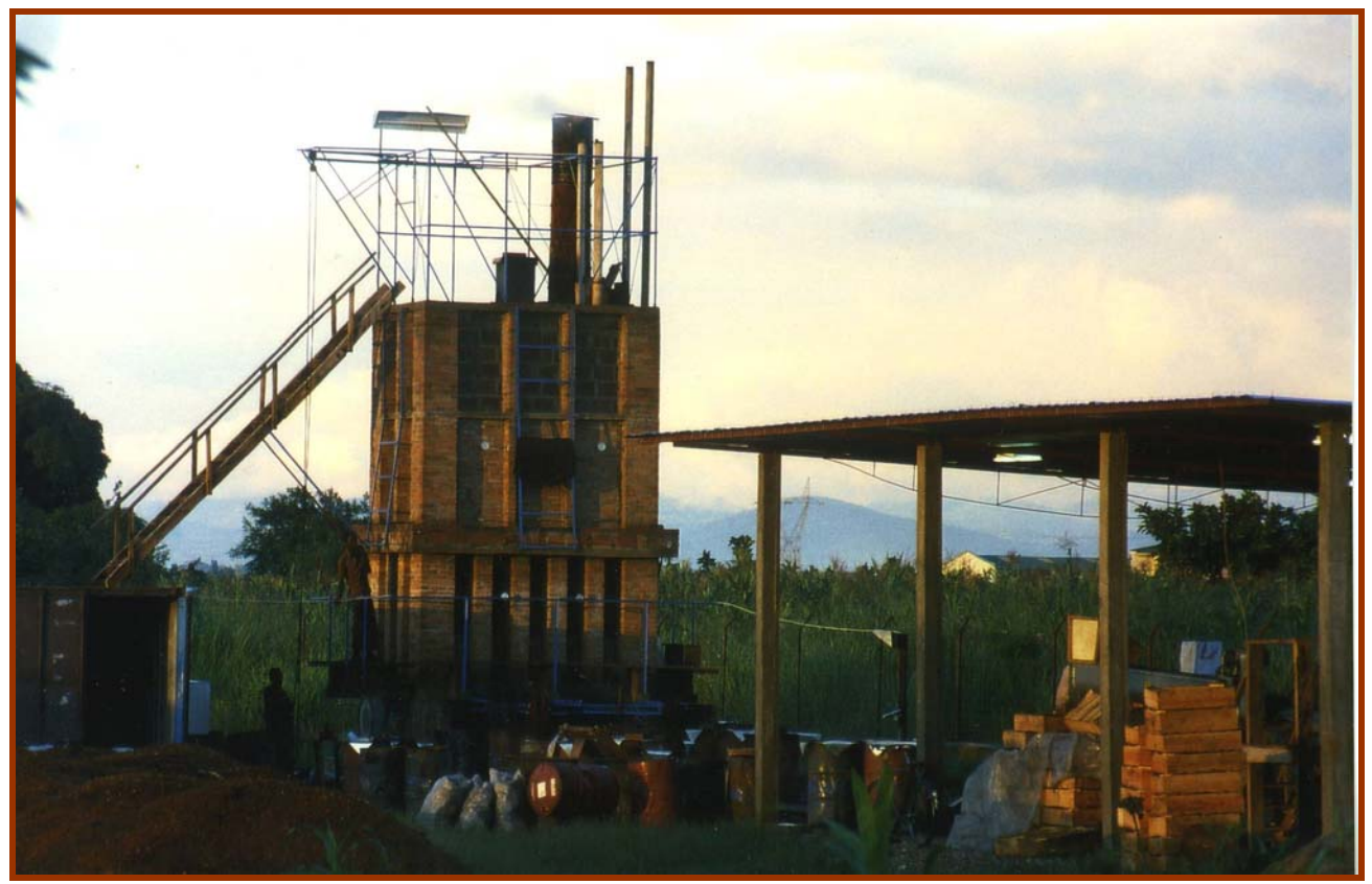
Photo 4: close up of the Continuous Carbonization System (height without chimney: 6.5m)