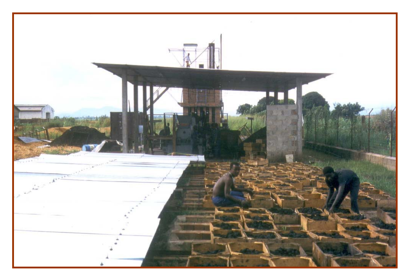
Photo 1: moveable hangars (rain protection) for solar drying of the bio coal briquettes

ONATOUR was a large institution which sold about 15.000 tons of peat per year. A lot of peat dust (fines) accumulated (about 10% of the amount of peat sold) on the places were the peat was stocked. Next to the compound of ONATOUR we had a coffee factory, a rice factory and we had an abundance of coffee hulls and rice husks and we also had wood chips available from carpentries near the town. This bio mass was not used and accumulated and rotted in large heaps! As a fifth component we had sugar bagasse available, with can be used as a good binder for bio coal briquettes. There were two sugar factories available, one in Burundi and one over the border, 15 km away in Zaire/Congo.